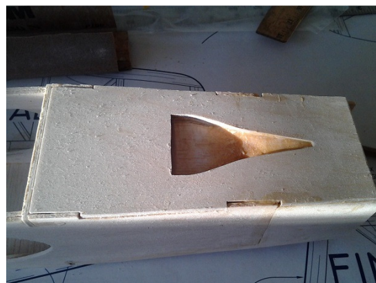
Ernie Blenkle is trying an NACA style intake duct. These are both efficient and low drag

For those building electric versions, some considerations need to be made to cool the batteries and motor controller.