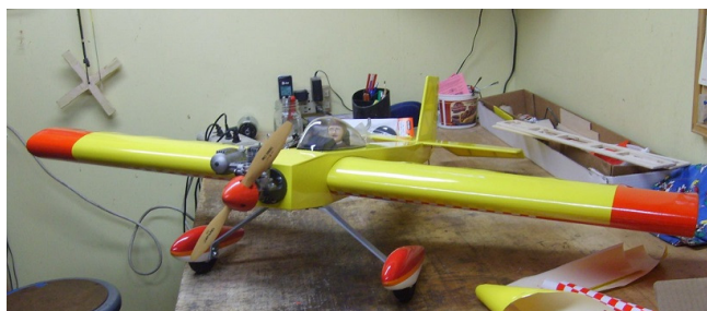
Ron Hilger is building two planes one electric and one glow. Both sport similar but different yellow and red colors.

Here are a couple of the color schemes so far.