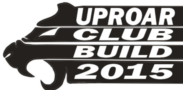
Keith Egging's idea is to emphasize the "Roar" in our build!

Are you creative? What to remember why and when you built your plane? Then how about throwing your design ideas into the ring for a nice sticker to add to your plane? Here are a couple of the ideas so far.