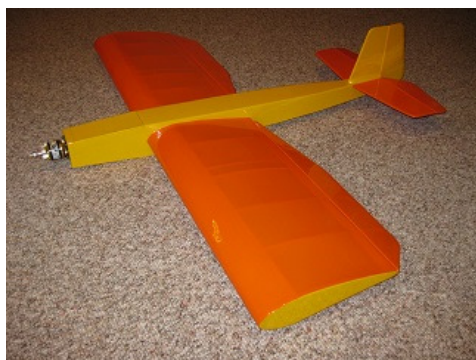
Scott Taylor is keeping colors bright using orange and yellow Ultracoat.